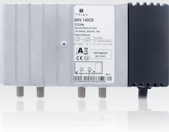
81323266 GHV 140 CD