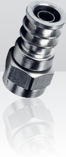
54246100 F-59-ALM 3,7/6,4