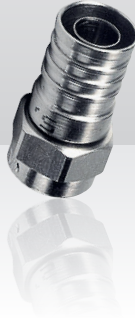
54248500 F-56-ALM 5,1/8,4