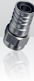
54253000 F-56-ALM 4,9/8,4