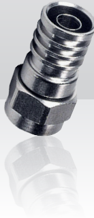
54251100 F-59-ALM 3,9/7,6