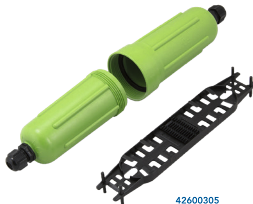
42600305 FDM1, open