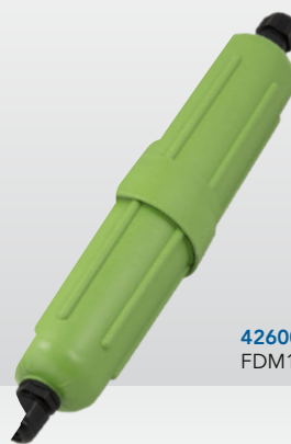
42600305 FDM1, closed