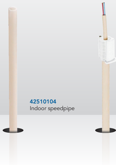
42510104 Indoor speedpipe