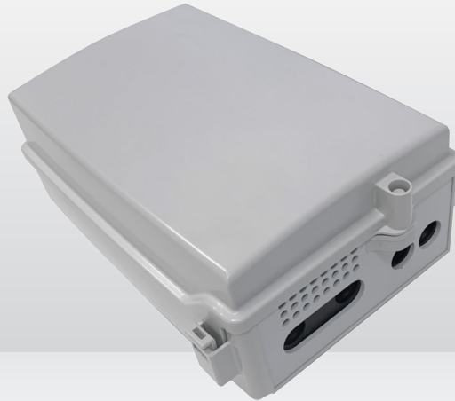
10418990 WAVEPACE® MDU-Wallbox-SP-24