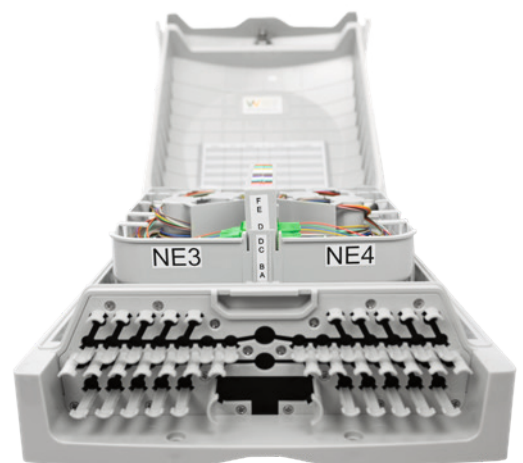
MDU-XL-Wallbox-DG Handling separation of network levels 3 and 4