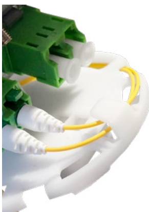
FWO-CS-LC/APC-2-2F Pigtail routing