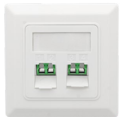
FWO-CS-LC/APC-2 Adapter access opened