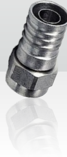
54253000 F-56-ALM 4,9/8,4