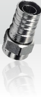
54248500 F-56-ALM 5,1/8,4