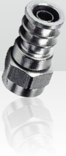
54246100 F-59-ALM 3,7/6,4